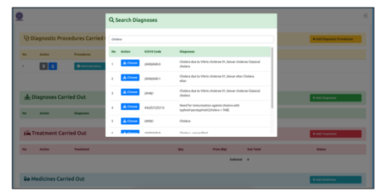
Picture 6. Form for Finding and Selecting a Patient's Disease Diagnosis